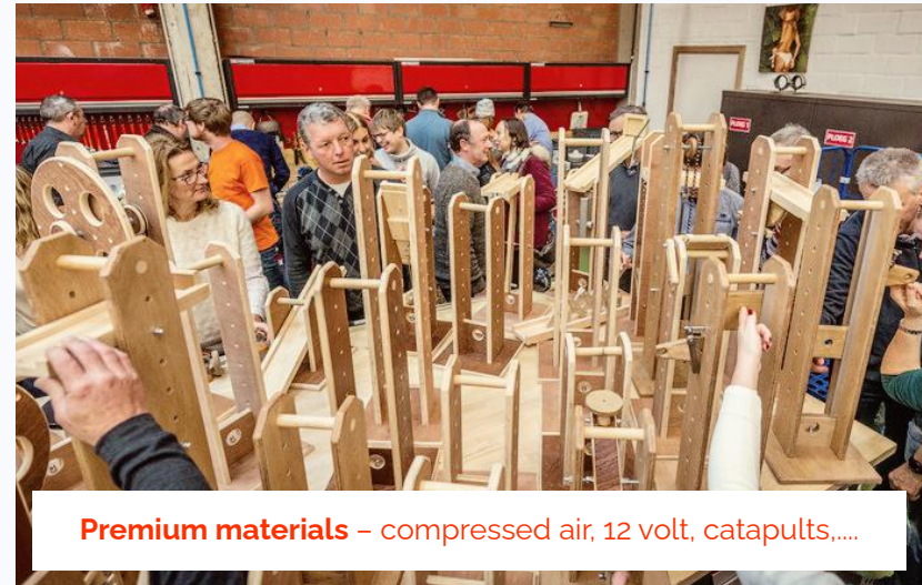
Premium materials – compressed air, 12 volt, catapults,....