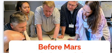
Before Mars Navigating Complexity