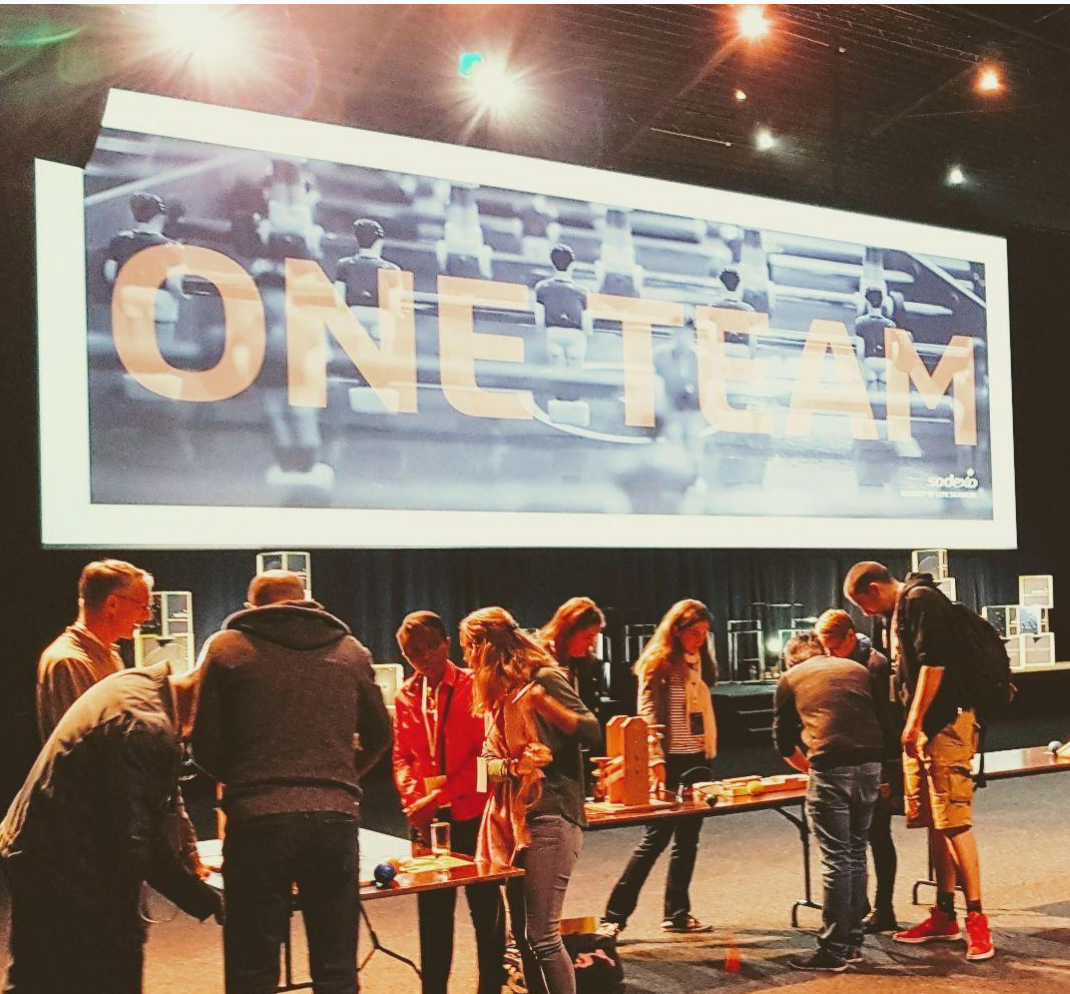
Breaking down silos – strengthening collaboration across teams