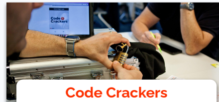
Code Crackers Challenging Assumptions