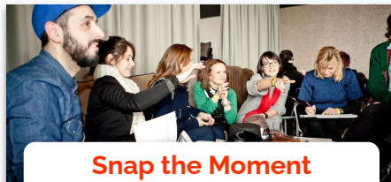
Snap the Moment Collaborative Storytelling