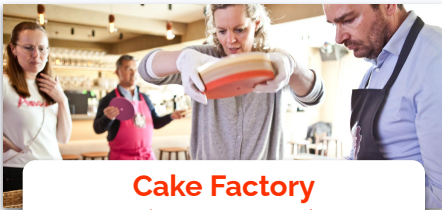
Cake Factory Getting Better, Together