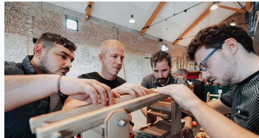
Collaboration – 1 link does not make a chain